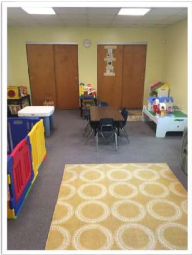
The Nursery in Room 5 is 15' x 24' (360 square feet) and is normally not for rent unless approved for special occasions