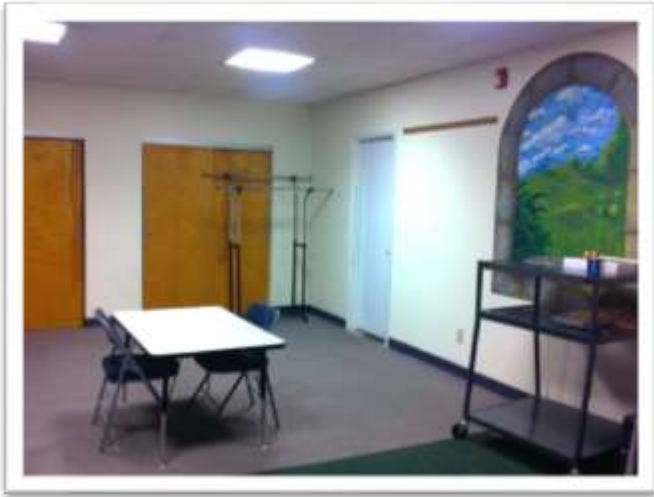
Room 4 is 15' x 24' (360 square feet)